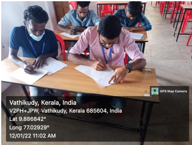
Vathikudy, Kerala, India V2PH+JPW, Vathikudy, Kerala 685604, India Lat 9.886842° Long 77.02929° 12/01/22 11:02 AM