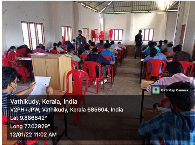
Vathikudy, Kerala, India V2PH+JPW, Vathikudy, Kerala 685604, India Lat 9.886842° Long 77.02929° 12/01/22 11:02 AM