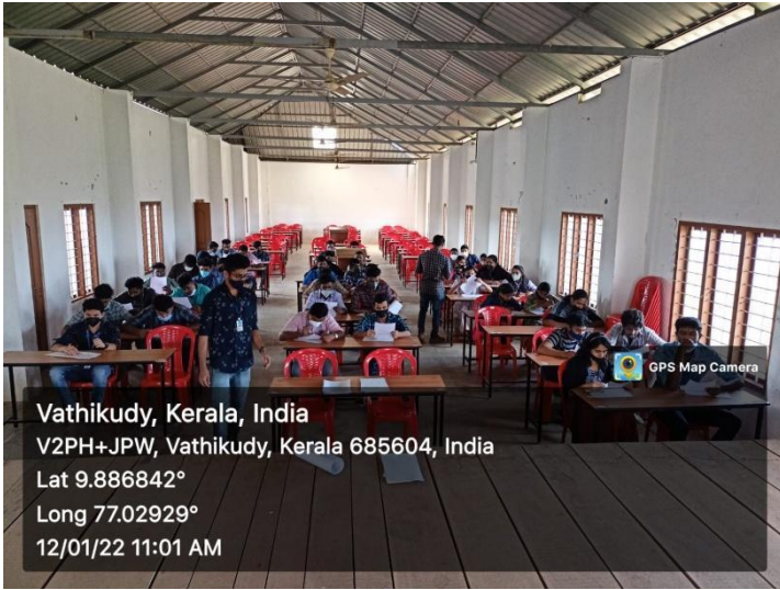
Vathikudy, Kerala, India V2PH+JPW, Vathikudy, Kerala 685604, India Lat 9.886842° Long 77.02929° 12/01/22 11:01 AM